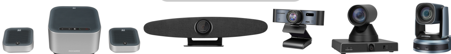
Speakerphone Conference • Videobar • Web Camera • PTZ Camera