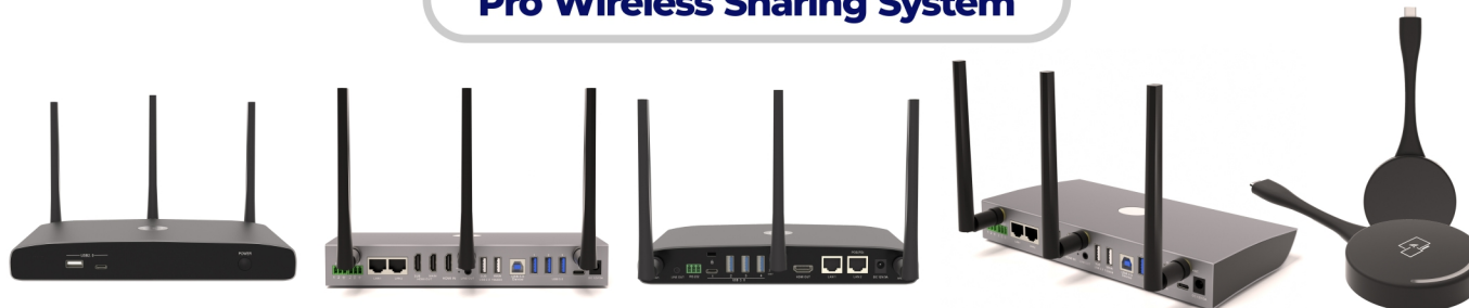
Wireless BYOM • Wireless BYOD • Pro+ Multi-view Processor