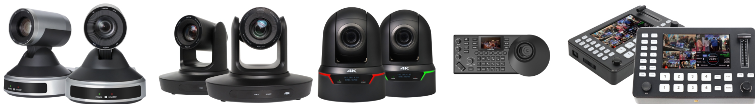
PTZ Conference Camera • Keyboard Controller • Video Switchboard Control Panel